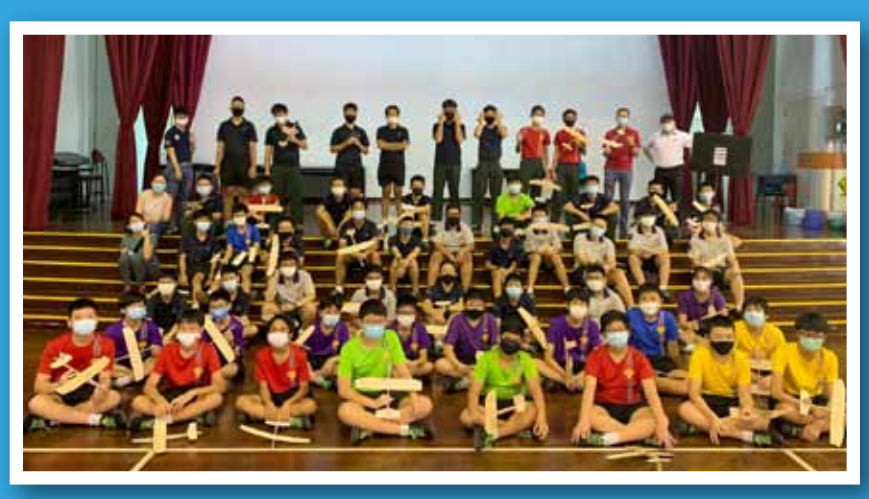
EGSS Students with their CCA Teachers and SYFC Aeromodelling Instructors

Evergreen Secondary School (EGSS) conducted the SAC on the 13 Nov 20, with their students competing in the Launch Glider segment. The students built the Launch Glider aeromodels based on specifications given, and the aeromodel that flew the longest distance off an elastic catapult launcher would win the contest.