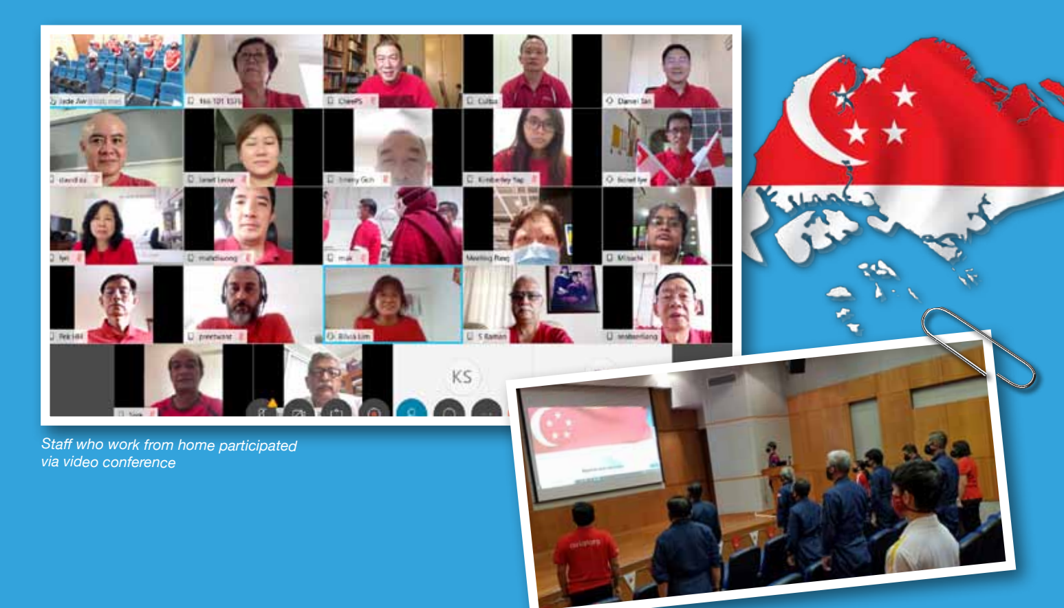
Singing the National Anthem

On 8 Aug 20, staff of SYFC and ST Engineering Aerospace Pte Ltd (STEA), as well as students on flying course, commemorated our nation's 55th independence through the singing of Majulah Singapura and the recitation of our Pledge. Due to cohort requirement under Covid-19, the poignant National Day Observance Ceremony was conducted via video conferencing.